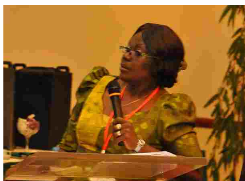
Dr. Ugo Elizabeth Honourable Commissioner Benue State Ministry of Education

place enduring and sustainable policies that would transform the sector positively. He concluded by asking the policy makers to also involve those that will implement the policies in the process and development of any policy in order to be sustainable.